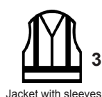
Jacket with sleeves