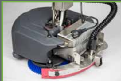
With multi-voltage cable 90/240 volt 50/60 hertz