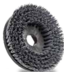
Tynex in Carbon