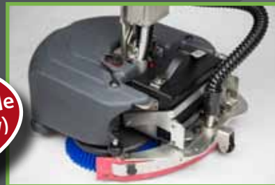
With lithium battery

EXCLUSIVE Only in our machine double power (cable and battery)