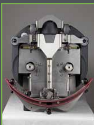
All stainless steel Inox AISI 304 frame

Muticleaning system with RECYCLED PLASTIC with stainless steel platform