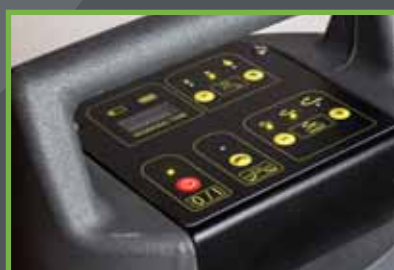
New control panel with intuitive buttons