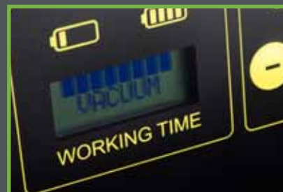
Adjustable suction power