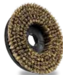
Pes Bristles Mixture