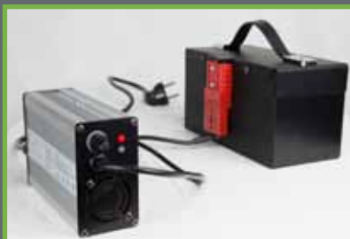
multi-voltage ventilated battery charger